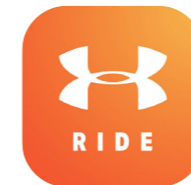
Map my Ride