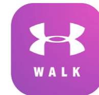
Map my Walk